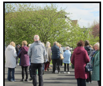
Photo: Setting out on Camino

The Marino Camino will take place again this year on Good Friday, 18th April. We will start our walk from the parish church of St. Vincent de Paul, at 4.15 p.m. and visit other churches within the boundaries of the parish of Marino. At each stopping point, we will reflect on Jesus' suffering and death and we will silently connect to our own and others' As part of the Marino Camino, a group of singers will perform the Stabat Mater on Good Friday, April 18th at 4pm in the MIE Chapel on Griffith Avenue.